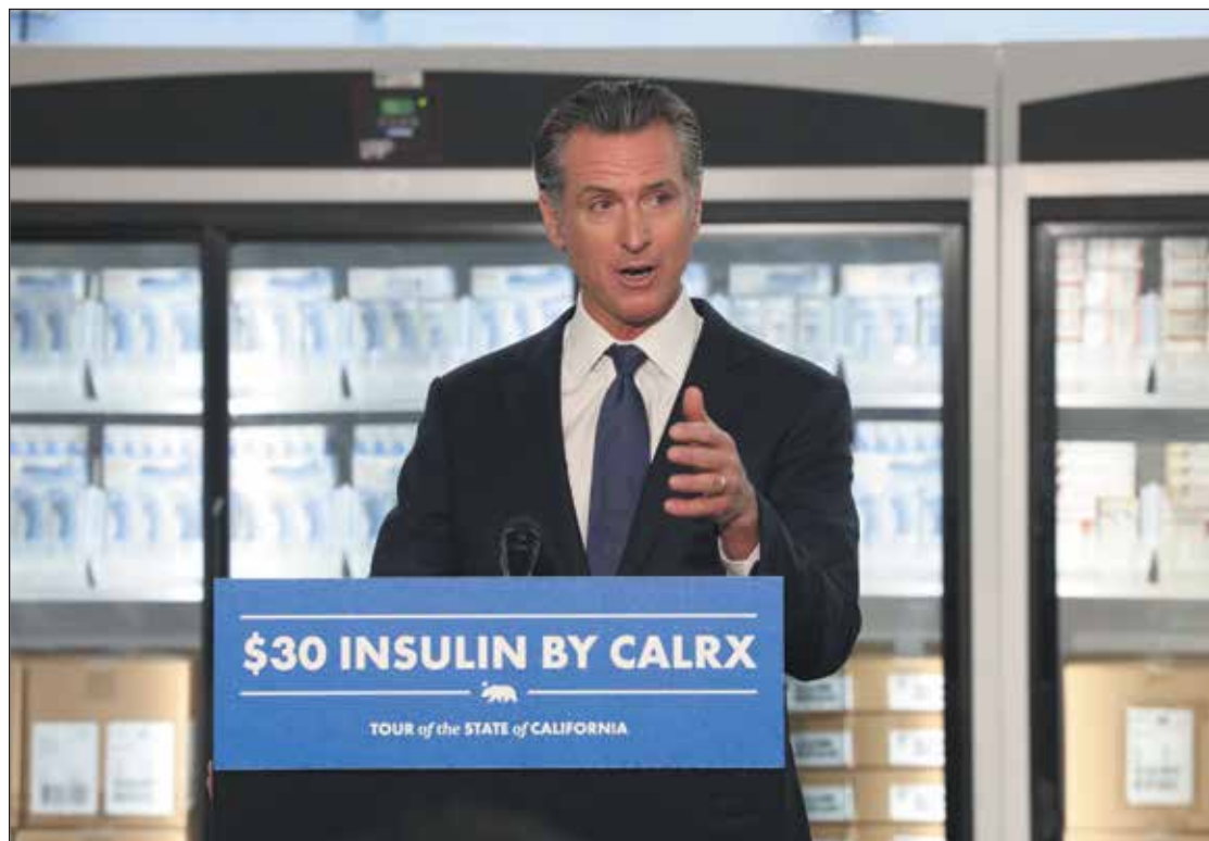
Gov. Gavin Newsom was in Downey on Saturday where he announced a partnership with Civica Rx to produce low-priced insulin.

The governor also announced Saturday that his administration was exploring the next potential product to bring to market --