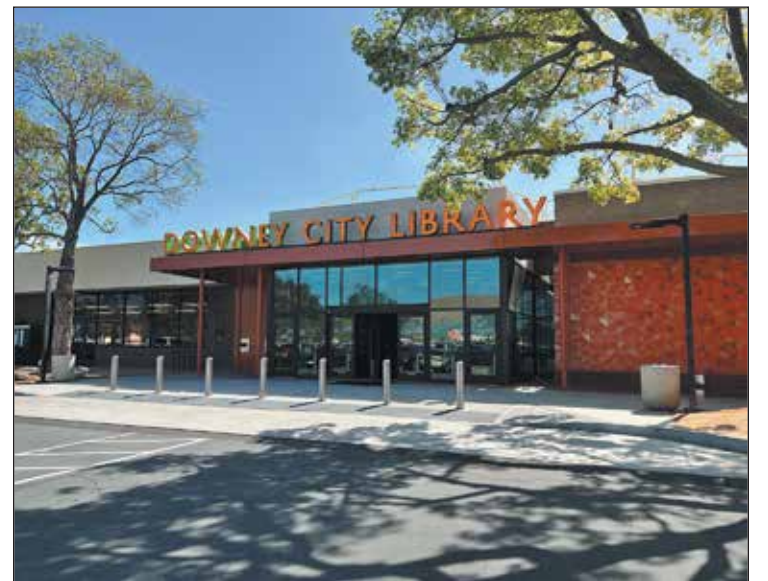
The Downey City Library will be open and operating as a cooling center Sunday for residents needing to escape the heat. The library will be open from 10 am to 5 pm.