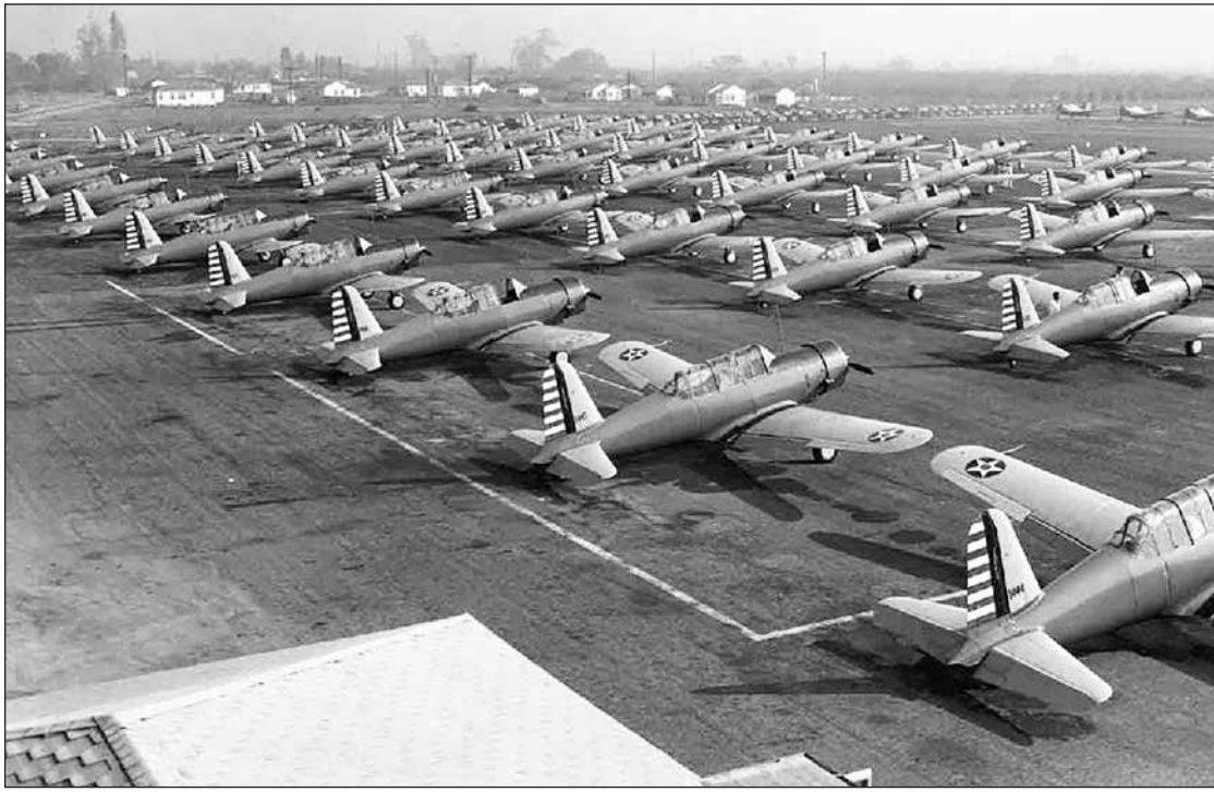
A fleet of Vultee aircraft at Downey headquarters in 1949.

■ Jerry Vultee reignited the aerospace industry in Downey, even if he didn't see the fruits of his labor.