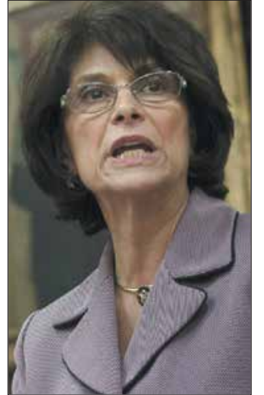
Rep. Lucille Roybal-Allard

Another amendment, from Rep. Mike Johnson, a Louisiana Republican, would exempt employees of pregnancy crisis centers from the ban. The pregnancy crisis centers are not certified health clinics and are aimed at dissuading pregnant patients from seeking abortions.