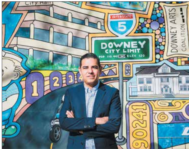
Robert Garcia stands in front of the Downey Doodleicious mural on Downey Avenue.

■ The Long Beach mayor gained a national profile as he led his city's fight against the pandemic. He could be Downey's future congressman.