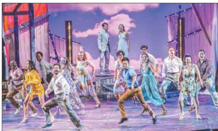
"Mamma Mia" opens at the La Mirada Performing Arts Center on Oct. 29.

With a string of #1 classics, including the most played song in radio history, "You've Lost That Lovin' Feelin'," the Rock and Roll Hall of Fame duo of Bill Medley and Bobby Hatfield topped the charts in four decades. After Bobby's death in 2003, Bill Medley continued to perform to sold-out crowds around the world, but fans and