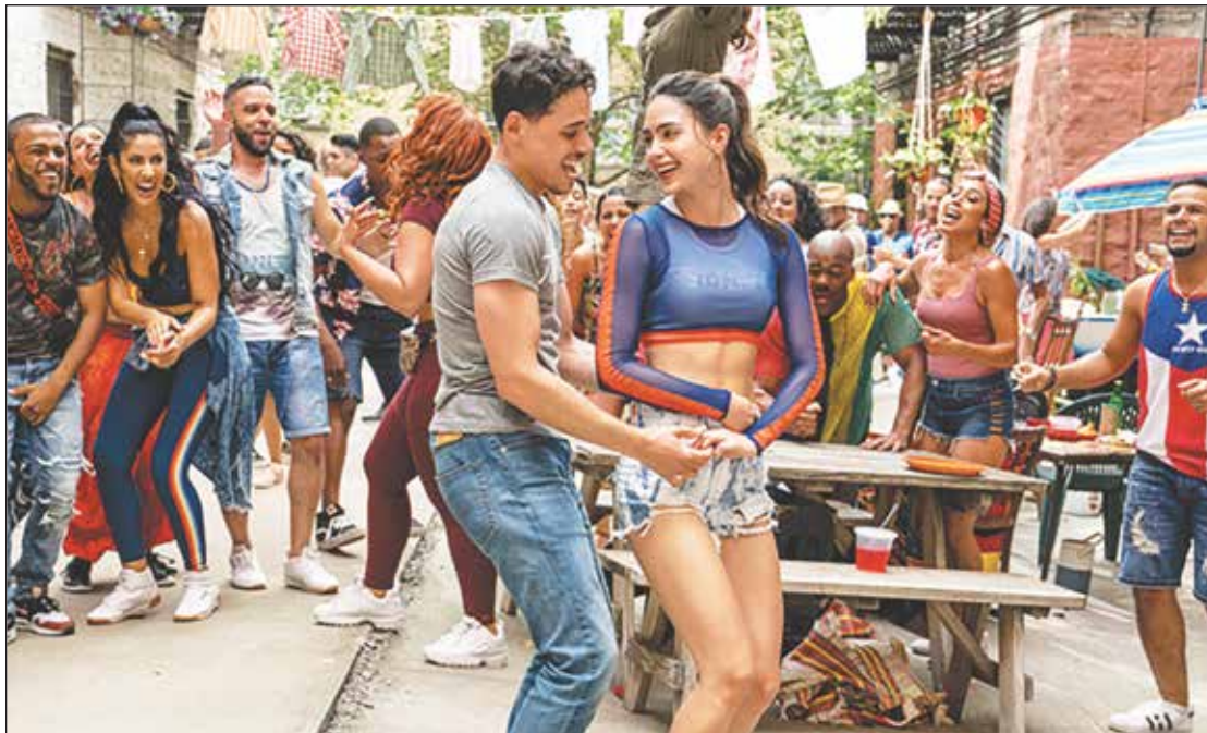
Lin-Manuel Miranda's "In the Heights" plays the La Mirada Performing Arts Center in June 2022.

Leno has captivated living rooms across the world for over 20 years with charisma, comedy,