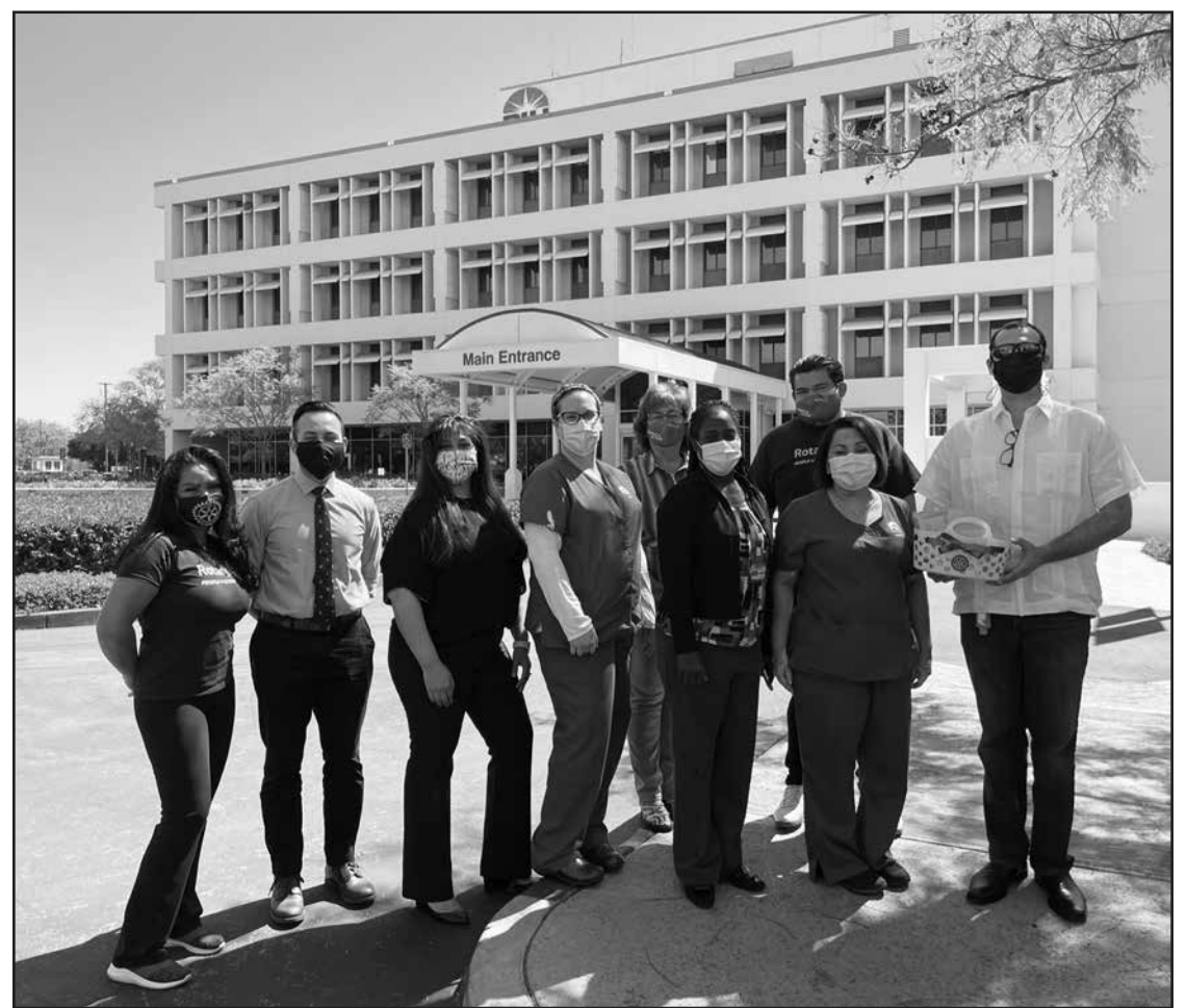
Last week, Rotary Club of Downey donated $2,625 worth of gift cards from five local restaurants to the Emergency Department of PIH Downey.

The proposal approved Tuesday directs county leaders to convene a workgroup including AAPI community leaders to consider ways to address the rise in anti-Asian hate and incorporate those strategies into the county's anti-racist agenda.