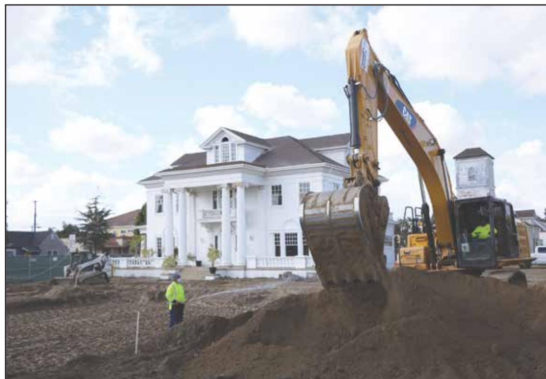
A coffee shop is being construction in the front yard of the Rives Mansion.

Construction of the coffee / juice bar is by and large a catch 22 for the city, who said they wished to see the property restored to its former glory yet has clearly stated that it is not in the financial position to do so.