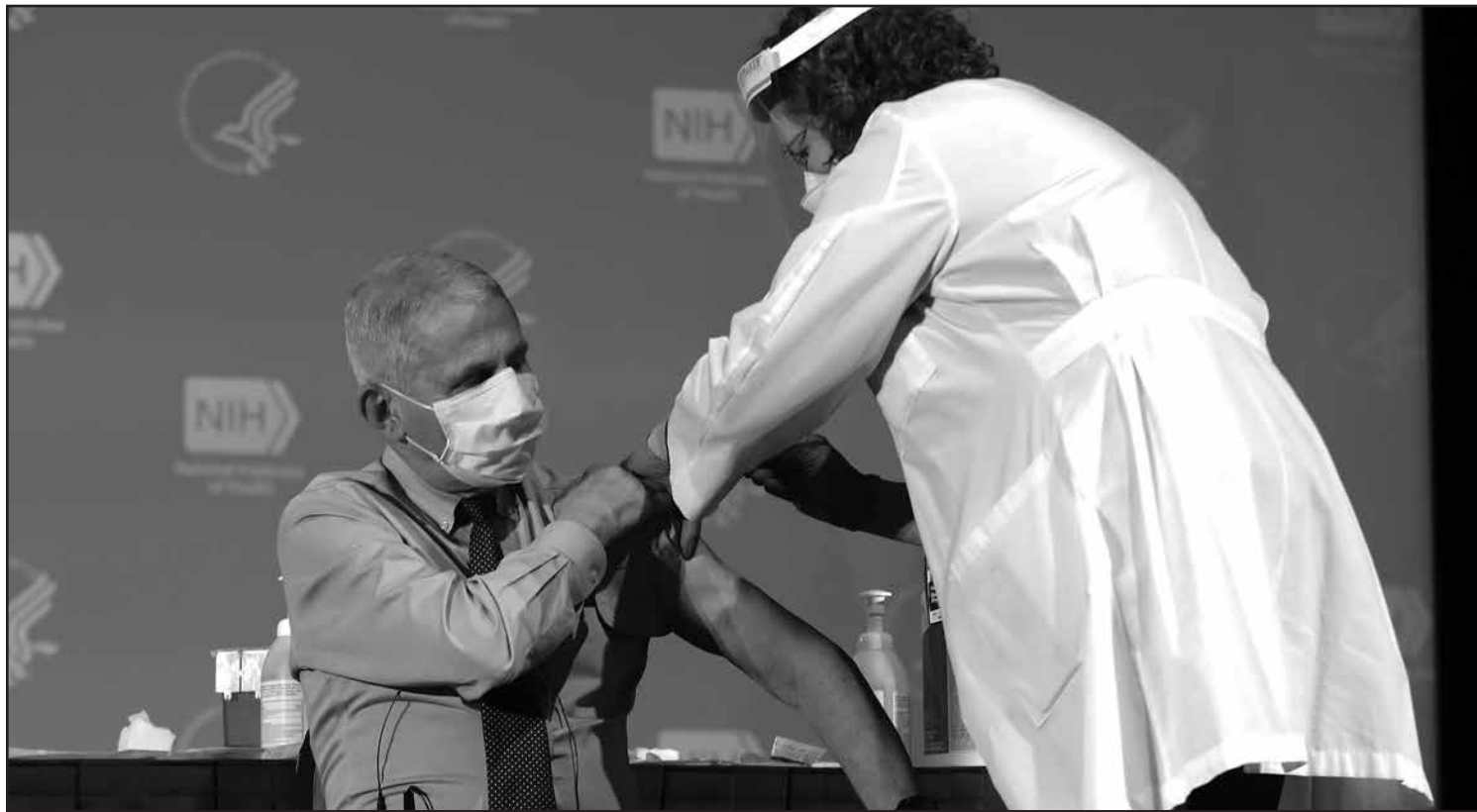
Dr. Anthony Fauci, Director of the National Institute of Allergy and Infectious Diseases, receives the Moderna COVID-19 vaccine.