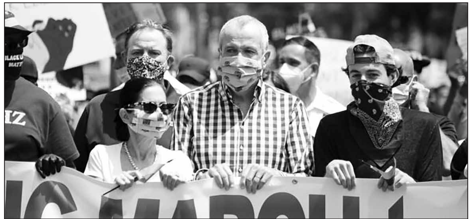
New Jersey Gov. Phil Murphy attends a Black Lives Matter protest despite his stay-at-home orders.

The public torture and murder of George Floyd — a 46-year-old black man — by white Minneapolis cops has crystallized the public awareness of our collective history of looking the other way when