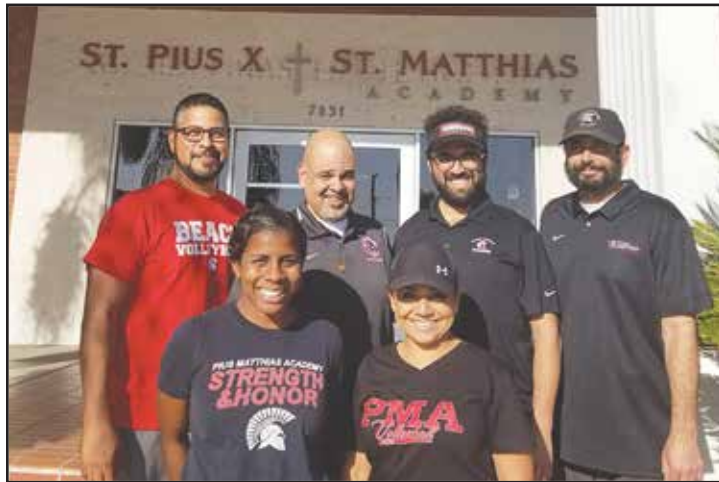
St. Pius X - St. Matthias Academy is Downey's only Catholic high school and offers a co-educational college preparatory curriculum.