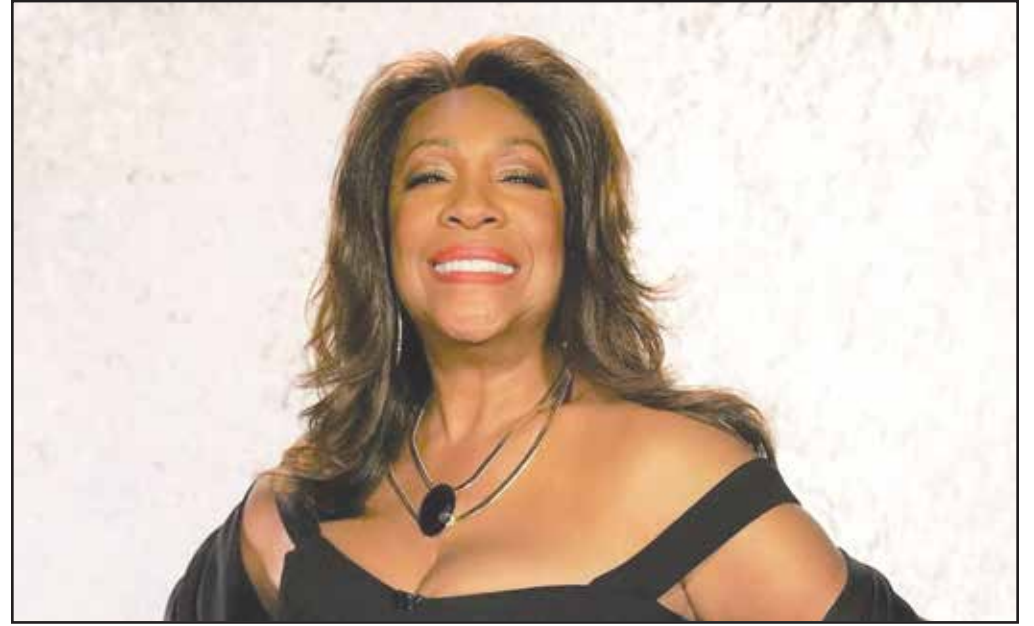
Mary Wilson of The Supremes will perform at the Cerritos Center for the Performing Arts on March 27, along with other Motown legends.

Since its 1993 inception, Yamato has mesmerized more than 2 million fans with its mastery of Japanese drums. The ensemble’s