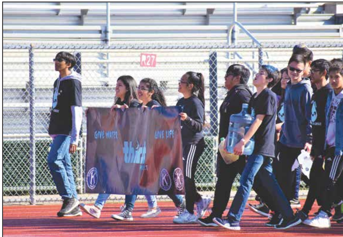
Downey High School students will hold a "Walk for Water" event Saturday as they try to raise $24,000 to build two water wells in developing parts of the world.

The winner will oversee the largest prosecutor's office in the U.S., with nearly 1,000 lawyers, and a territory that covers the nation's second-largest city and 10 million residents across the sprawling county.