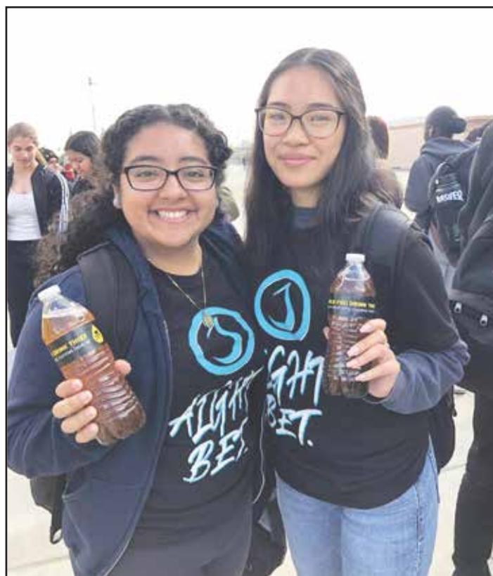
Downey High School students hold dirty water bottles that were distributed on campus to help promote Saturday's Walk for Water event.

annual Walk for Water will be held at Allen Layne Stadium, in Downey High School. Those who attend the event will have the opportunity to walk 12 laps around the track or less carrying water in either water gallons or jerry cans depending on the participant's ability.