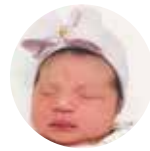
PHOTO Downey's Leap Year baby SEE PAGE 4

NEWS Military Career Week at DUSD SEE PAGE 3