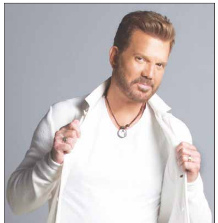
Cuban bandleader Willy Chirino, credited with helping create the "Miami sound" of salsa music, has added a second show at the Downey Theatre after the first concert sold out.

Downey Theatre 50th Anniversary Party, 3 pm. A celebratory event