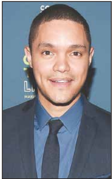
"The Daily Show" host Trevor Noah is returning to the OC Fair this summer.