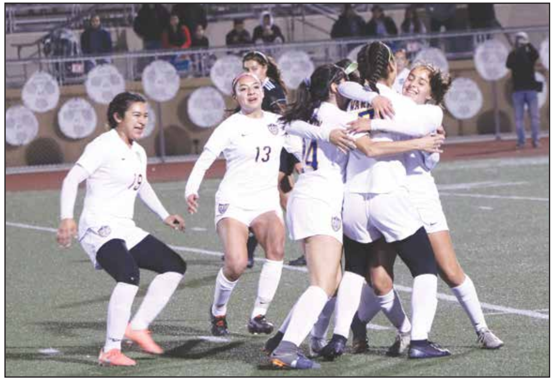
Warren players celebrate a goal in their game against Downey on Tuesday. Warren High came out victorious, 2-1.

players are all looking forward to finishing league play on a strong note and qualifying for postseason play. Warren is the defending 2019 S.G.V.L. champion.