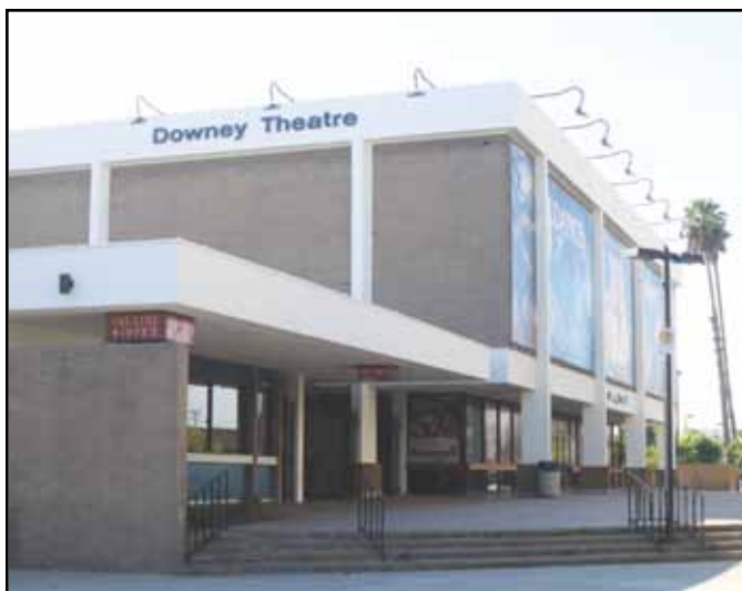
Downey will seek outside proposals for marketing of the Downey Theatre and the production of local shows.