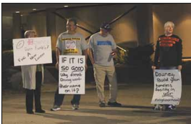
Protestors outside Downey City Hall before Tuesday's City Council meeting.