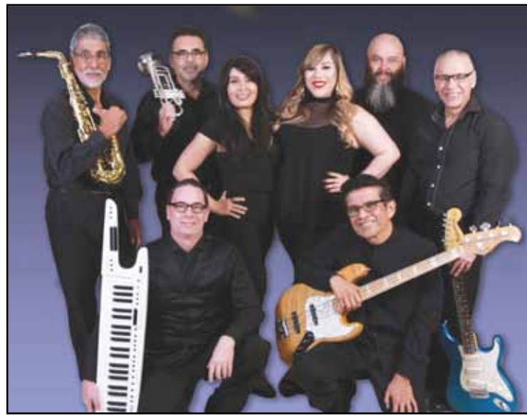
Downey's summer concert series at Furman Park resumes Wednesday with Suave, a 10-piece band that performs everything from jazz, rock, swing, R&B, and of course, Latin music, including cumbia, merengue, salsa, cha-cha and much more.