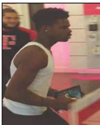
Police are searching for this person, accused of stealing cell phones from a T-Mobile store in Downey last week.

Anyone with information is asked to call Detective Whinkler Zamora at (562) 904-2324. Tips can be made anonymously by texting the letters TIPLA, plus the tip, to 274637.