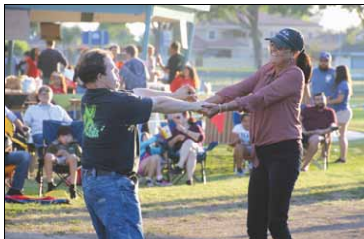
Last week's concert was headlined by Knyght Ryder, an 80's and 90's tribute band.