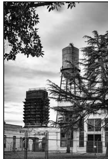
Downey is in the "final stages of negotiation" to acquire 5 acres of park land on the south Rancho Los Amigos campus.

Public safety plays a significant role in Downey's 2018-19 fiscal budget. This year,