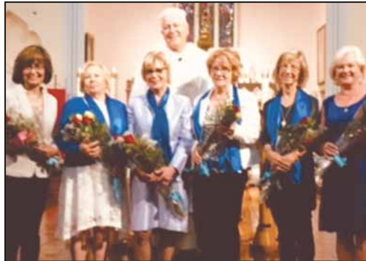
The Executive Board of the Women's Guild of Our Lady of Perpetual Help Church was installed at Mass on May 18.

Items have opening bids from $5-$7 and are on display in the library lobby. Bids can be made through noon, Saturday, June 30th, on cards in the Friend's Bookstore located in the young adult section of the library.