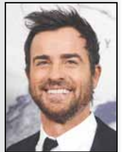
Justin Theroux , actor, 46