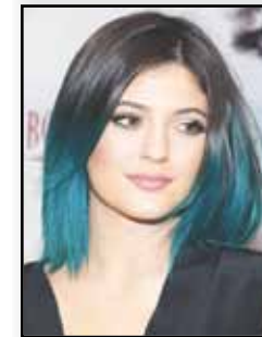
Kylie Jenner , reality star, 20