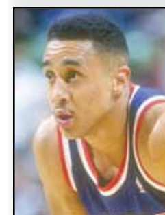
John Starks , basketball player, 52