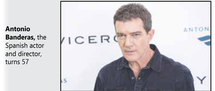
Antonio Banderas , the Spanish actor and director, turns 57