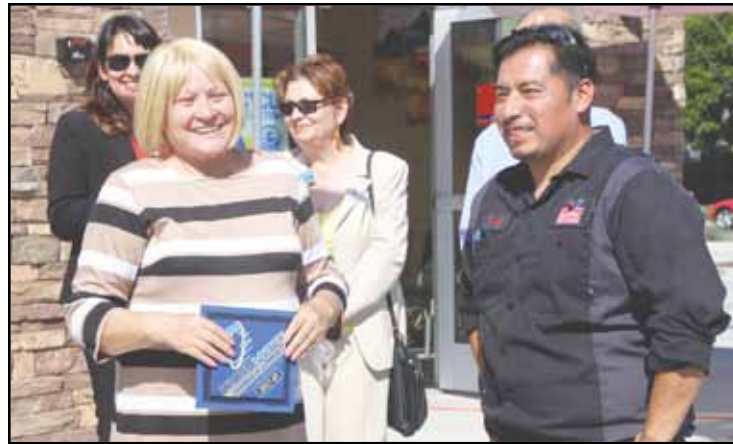
Valvoline celebrated the grand opening of its new oil and lube center Wednesday at 7737 Firestone Blvd.