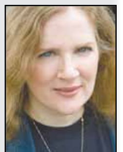
Suzanne Collins , author, 55