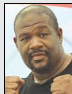
Riddick Bowe , boxer, 50