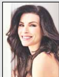
Julianna Margulies actress 51