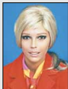
Nancy Sinatra singer 77