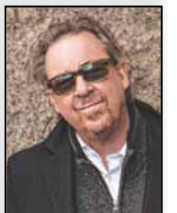
Boz Scaggs guitarist 73