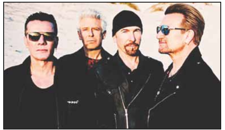
Tickets go on sale Monday to see U2 at Qualcomm Stadium in San Diego on Sept. 22.

Set against the colorful backdrop of Old Broadway, this story highlights the brash, colorful, cocky, charismatic and uncompromising man, from his humble beginnings with his hard-knock days with his family on the vaudeville circuit to his reign as the star-spangled 'King of Broadway.' Cohan's life was a roller coaster ride of professional highs and lows and personal triumphs and heartbreak. Featuring 25 songs, including some new music and adaptations of the classics.