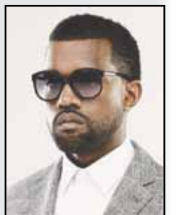
Kanye West rapper 40