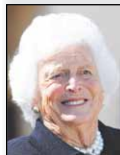
Barbara Bush former first lady 92