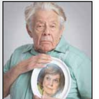
Jerry Stiller , the comedian and actor who starred in 'Seinfeld' and 'King of Queens', turns 90