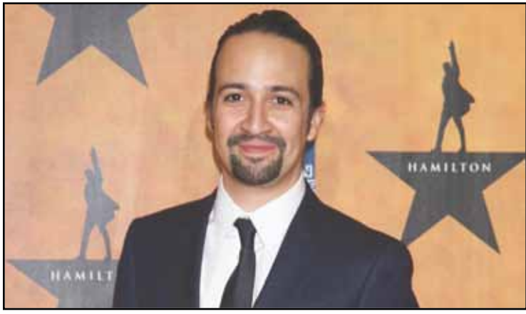
Lin-Manuel Miranda's "In the Heights" opens at Musical Theatre West in Long Beach on Oct. 20.

LONG BEACH - Musical Theatre West has announced its 65th anniversary season of shows, including the award winning musical "In the Heights" by Lin-Manuel Miranda of "Hamilton" fame.