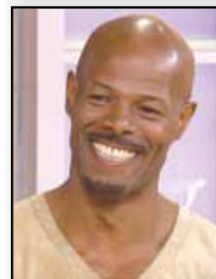
Keenen Ivory Wayans actor 59