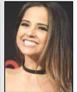
Becky G singer 20