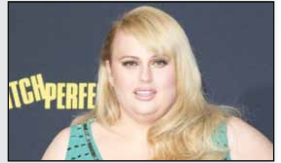
Rebel Wilson, the Australian actress and comedian, turns 37