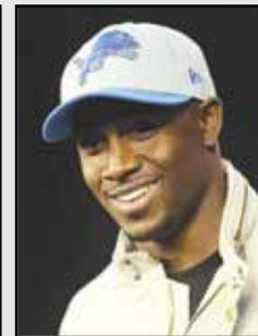
Reggie Bush running back 32