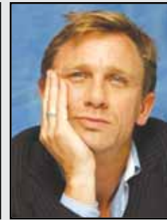
Daniel Craig actor 49