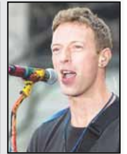
Chris Martin singer 40