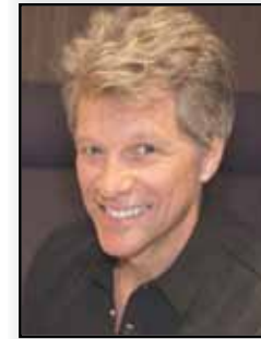
Jon Bon Jovi rock singer 55