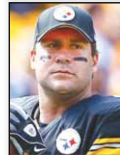
Ben Roethlisberger quarterback 35