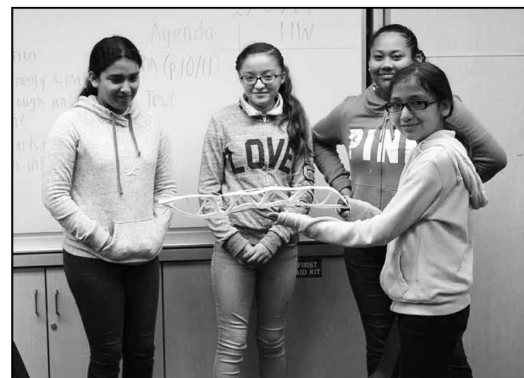
Paramount Park Middle School sixth-graders display their airplane wing prototypes after working with Boeing engineers to construct the project.

PARAMOUNT – Using only four common household items, Paramount Unified sixth-graders let their imaginations soar, designing and constructing airplane wing prototypes under the guidance of Boeing engineers, who visited all five PUSD middle school campuses on Feb. 6 in celebration of National Engineer's Week.