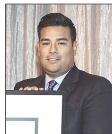
State Sen. Ricardo Lara (D-Bell Gardens) authored SB 958.

Supporters of SB 958 pushed the measure through the state Legislature in Sacramento without holding any meetings in Los Angeles County and over the objection of County