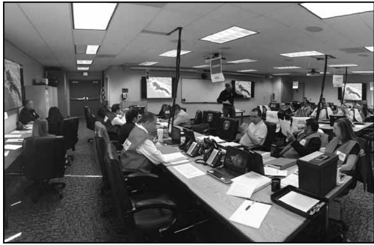
City employees undergo training at Downey's Emergency Operations Center, located at Fire Station No. 1.