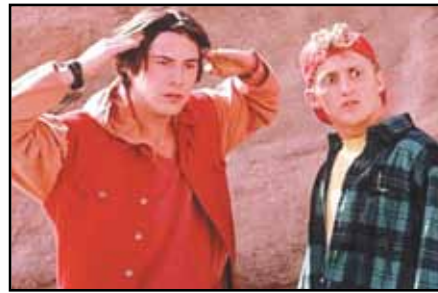
'Bill & Ted's Bogus Journey' is leaving Netflix.

The Nanny Diaries Food Chains Jail Caesar The Days to Come Two Hundred Thousand Dirty Pit Stop Rigor Mortis Hansel vs. Gretel