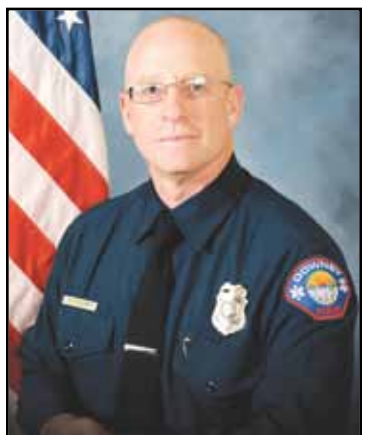
Tickets are on sale for the second annual Downey Police & Fire Foundation awards luncheon, taking place April 19 at 11:30 a.m. at the Rio Hondo Event Center.

In 2016-17, the expansion will bring the program to three classes each in kindergarten through second grade and three classes in third grade.