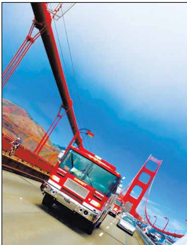
This photo shows Engine 61 crossing the Golden Gate Bridge on its way home from the Humboldt County fire on Sunday. "After a week of wildland firefighting in Northern California's Humboldt County, Downey Engine 61 and Strike Team XLG-1261-A have been demobilized today and are returning home," the department posted. "Check out this photo of Engine 61 crossing the Golden Gate bridge this afternoon! Great work by our firefighters!"

For more information, or to send questions in advance, call (562) 904-7274 or email asaab@downeyca.org.