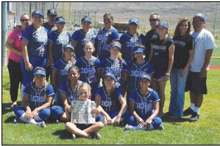
Competing against 71 other teams, Downey's Nemesis 18u softball team advanced to the quarterfinals of the Triple Crown World Series, held last week in Reno, Nev. The team also remembered to bring their Downey Patriot for the group photo.