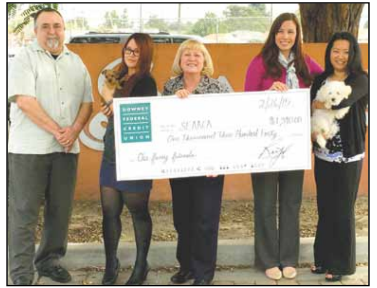
Downey Federal Credit Union employees are pictured making a donation to SEACA. The credit union recently donated nearly $6,000 to local charities.