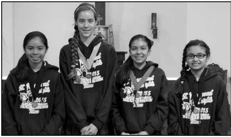
The St. Raymond academic decathlon team brought home four medals after competing in the 25th annual Los Angeles Archdiocese Academic Junior High Decathlon on March 7 at the L.A. Sports Arena.