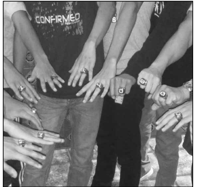
The Warren High School cross country team finally received their 2014 C.I.F. Division 1 championship rings Wednesday. A dinner at Pina's Pizza House on Wednesday evening was used to celebrate the occasion. The team's combined grade point average is 3.67.