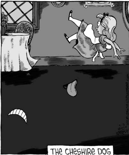
THE CHESHIRE DOG