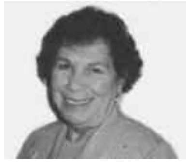
National Cemetery next to her husband.