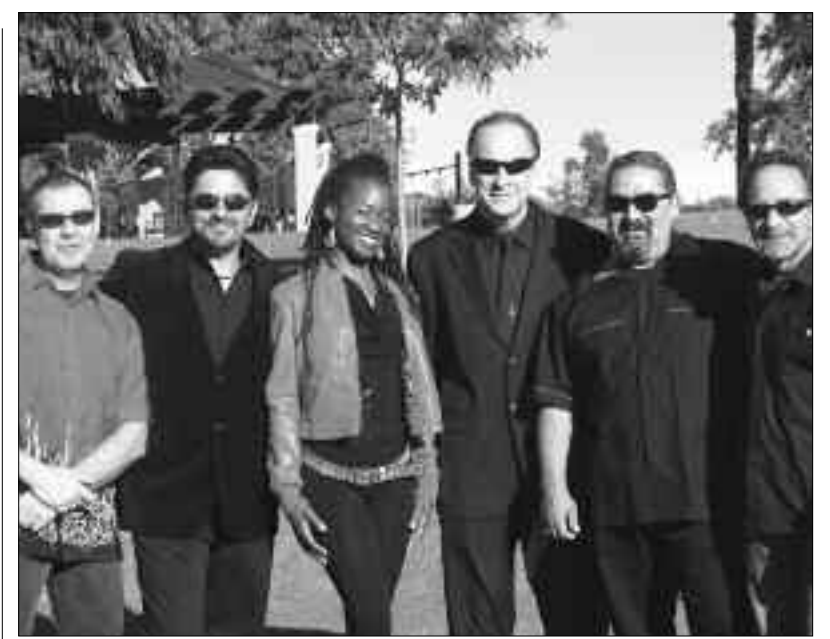
Classic rock band Alter Ego will perform Wednesday night at Furman Park. Admission is free.

A memorial service is scheduled for July 23 at 11 a.m. at First Baptist Church of Downey.