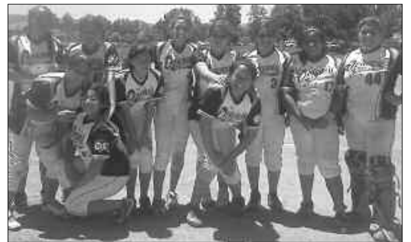
The Downey Ponytail 14u all-star team took first place in a softball tournament held this past weekend in Murrietta.