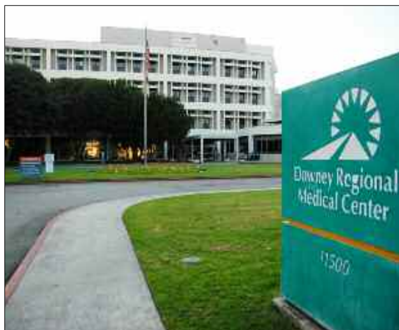
Downey Regional Medical Center leases its land from the city of Downey at an annual rate of $1, in a lease approved by Downey voters. The hospital made two offers recently to purchase the land outright but could not reach a deal with the city.

"The city's view of the value of the lease was as if the property was on the market right now," Fuller said. "Our view is that the land